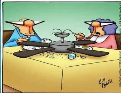
"What else did you fix today?"