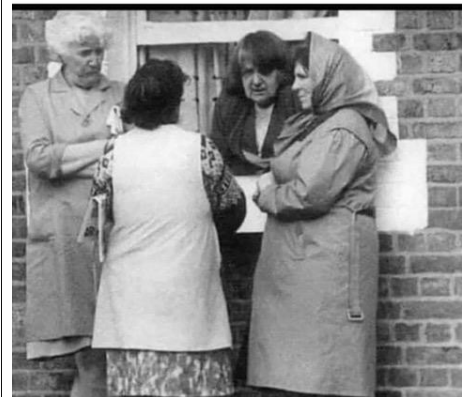
Pre internet chat room using An old version of windows...